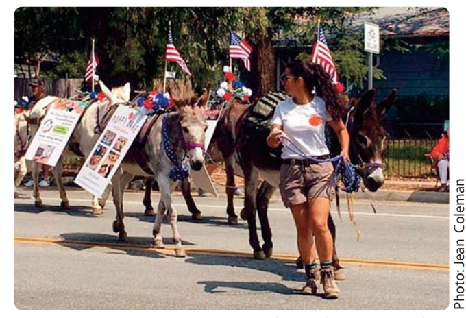
The Pack Station Mules