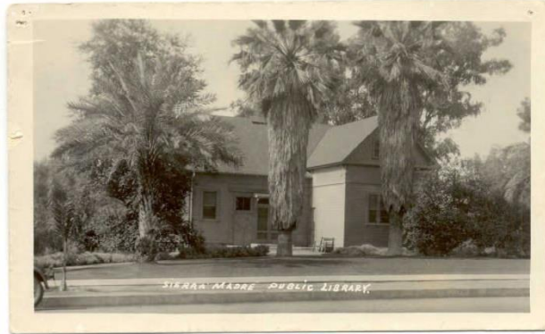
1915 Note the palm trees in front of the library! Still there today!