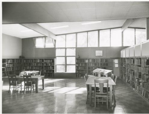
1955 Memorial Children's Room