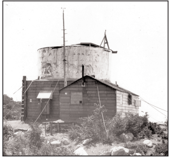
Harvard Observatory on Mount Wilson, ca. 1889.

October 14 Tuesday 7:30 PM Senior Center in Memorial Park 222 W. SIerra Madre Blvd.