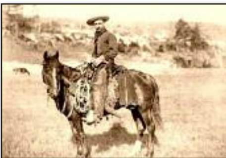
Cowboy circa 1888

The Cowboy must never shoot first, hit a smaller man, or take unfair advantage.