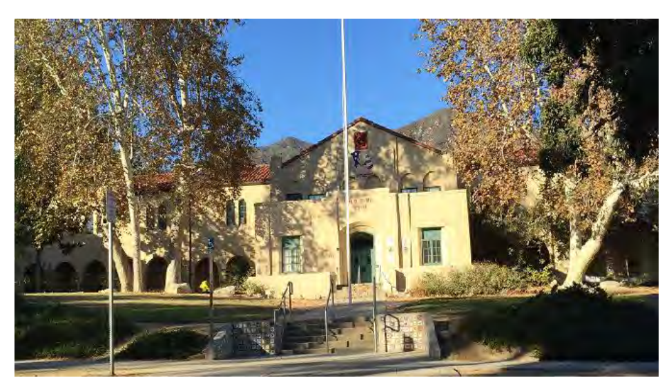
(Enjoy archive photos of the School on page 2)

Reprinted by permission of the Pasadena Unified School District (www.pusd.us)