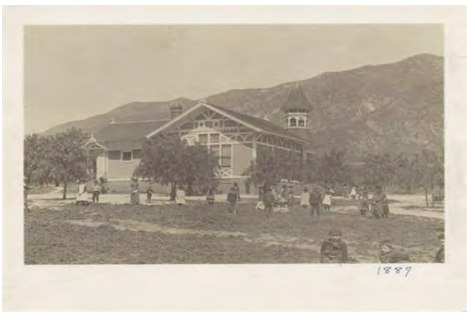
Images of Sierra Madre School, Left: June 1917, Above: circa 1887