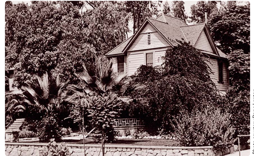
Tufts house about 1900

[Ed note: Historical Society members and their guests are invited to tour the Tufts House on October 29. The following is a brief biography of the original owner, as recounted in The Annals of Early Sierra Madre , published in 1950. It is believed that the Tufts family descendants occupied the home until 1948. The present owner purchased the home in 1972.]